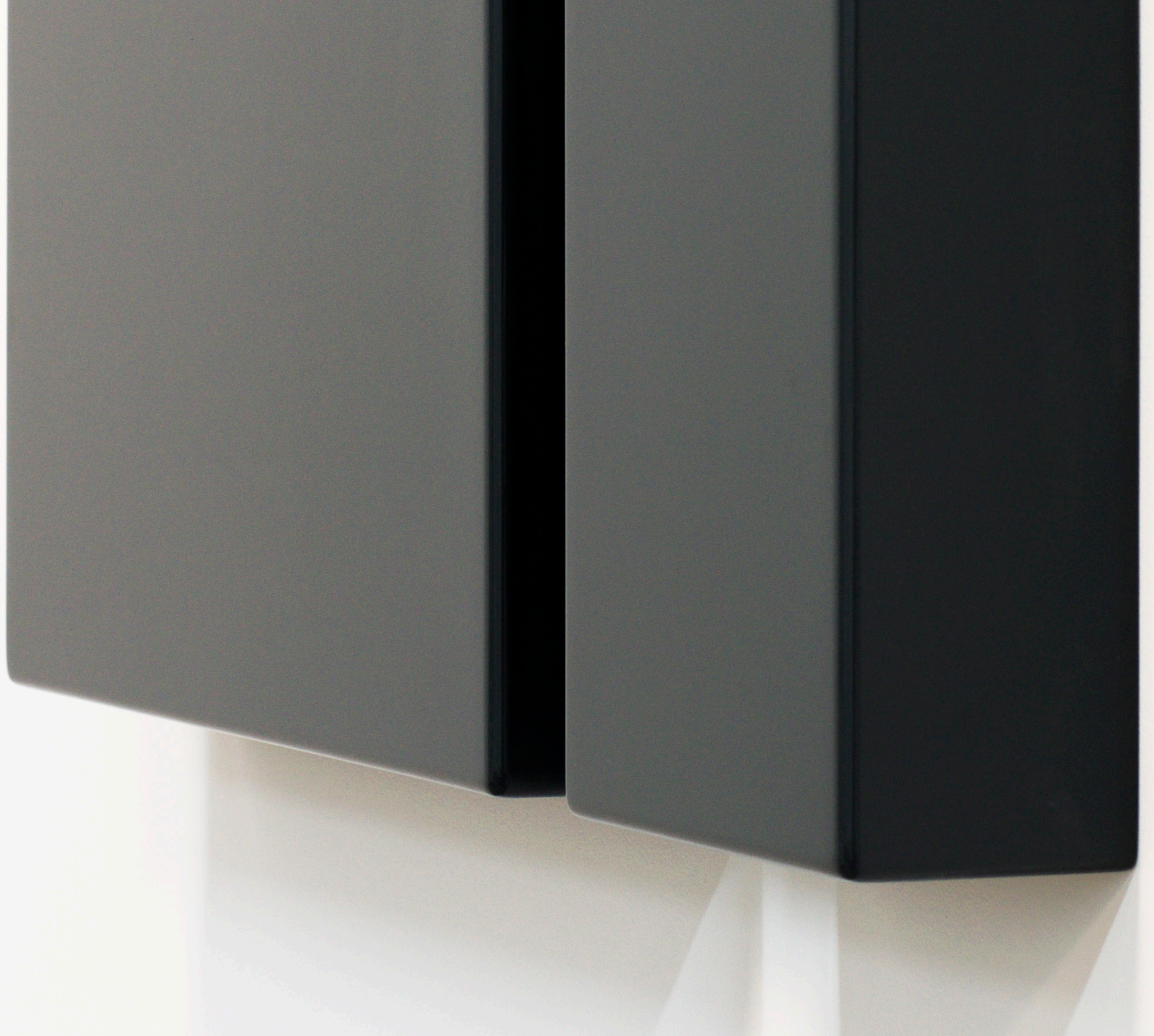
Untitled #8 2016 MDF, polyurethane 49 × 70 × 8.5 cm $2,200