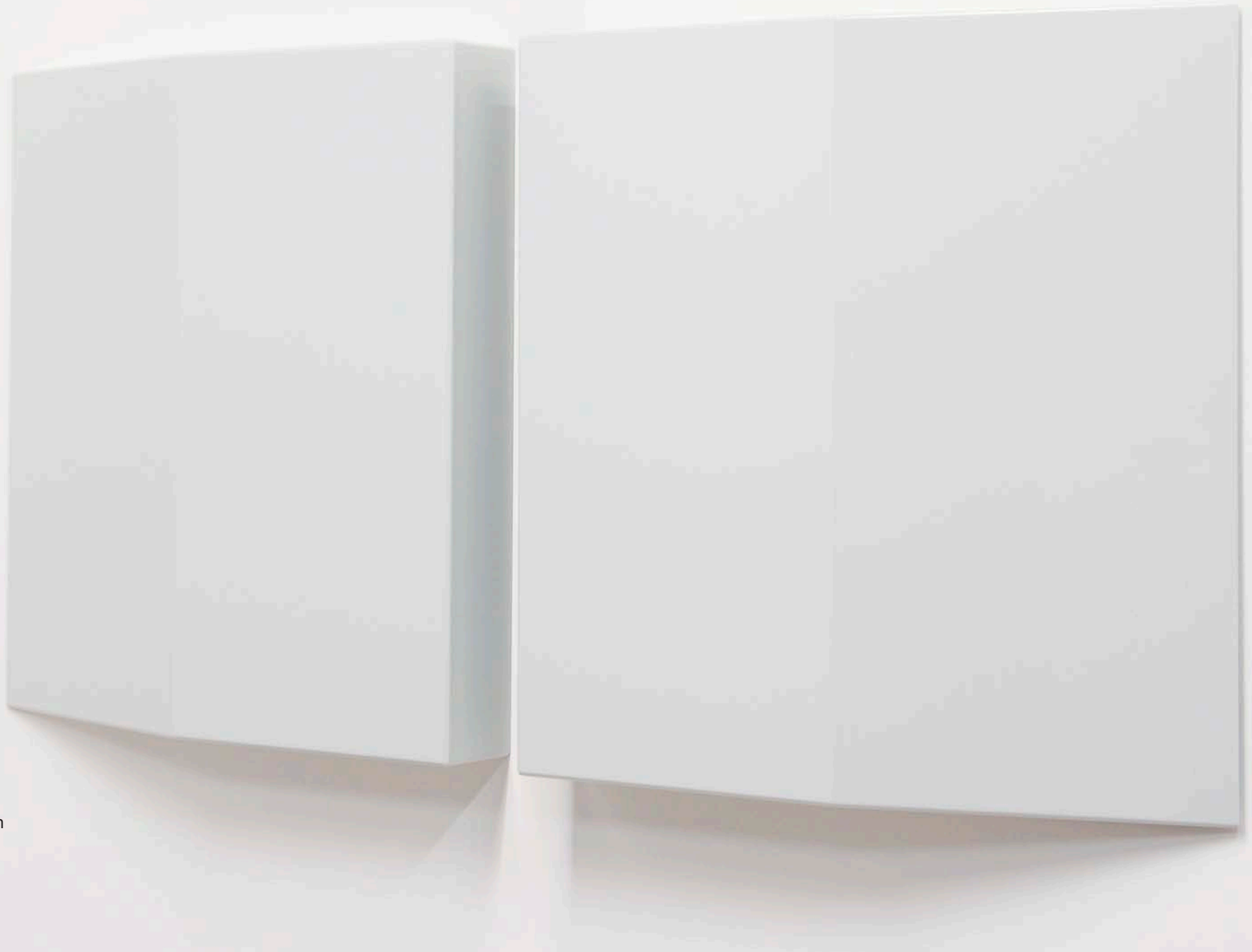
Untitled #3 2016 MDF, polyurethane 82 × 81.4 × 12 cm each $5,500